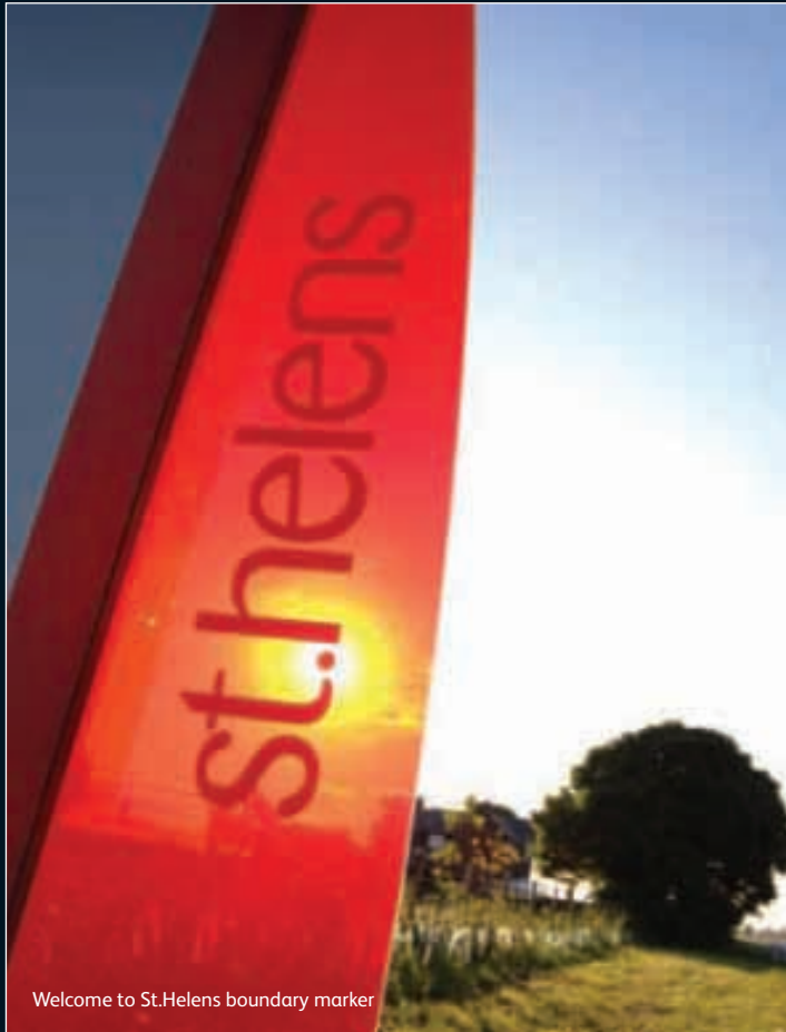
Welcome to St.Helens boundary marker