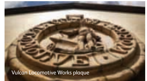
Vulcan Locomotive Works plaque