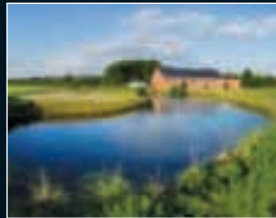
The North West & National Golf & Country Club