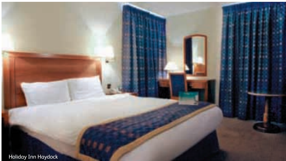
Holiday Inn Haydock