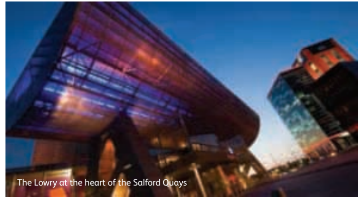
The Lowry at the heart of the Salford Quays