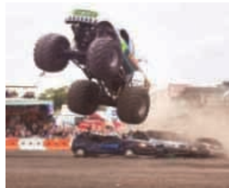
Monsters and more at Truckfest North West