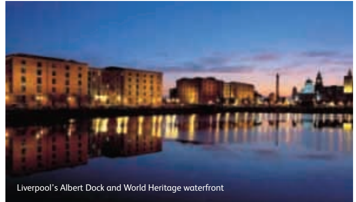
Liverpool's Albert Dock and World Heritage waterfront