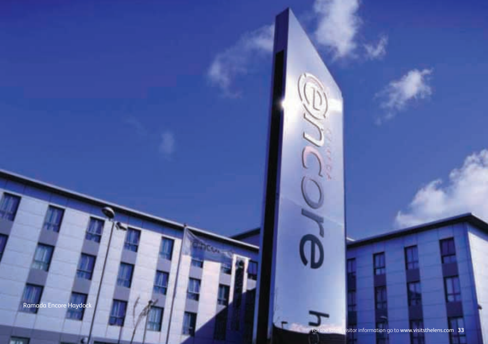
Ramada Encore Haydock