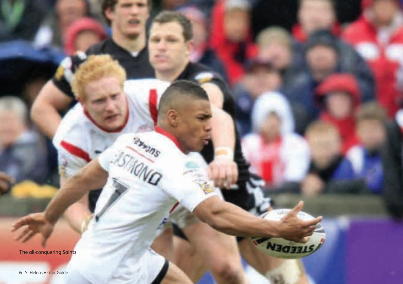
The all-conquering Saints