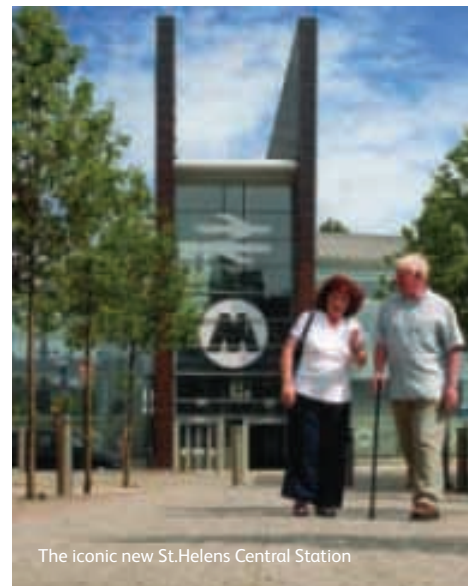
The iconic new St.Helens Central Station

St.Helens is only 27 miles and less than 35 minutes drive (via the M56 and the M6 or M62) from Manchester International Airport, the 3rd largest in the UK and the region's primary domestic and international gateway by air.