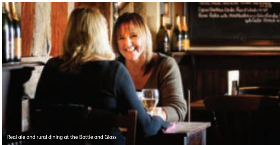
Real ale and rural dining at the Bottle and Glass