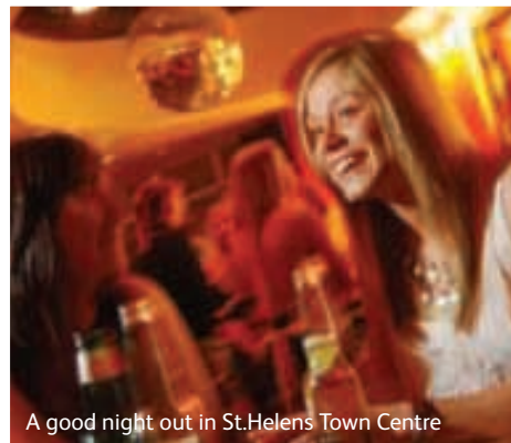
A good night out in St.Helens Town Centre