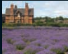
Inglenook Lavender Farm