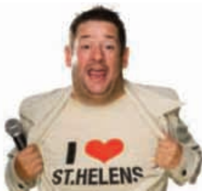
St.Helens' own Johnny Vegas