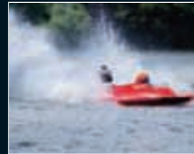
Powerboat racing at Carr Mill Dam