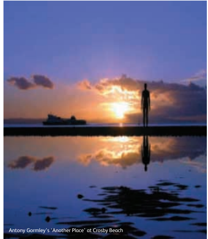
Antony Gormley's 'Another Place' at Crosby Beach