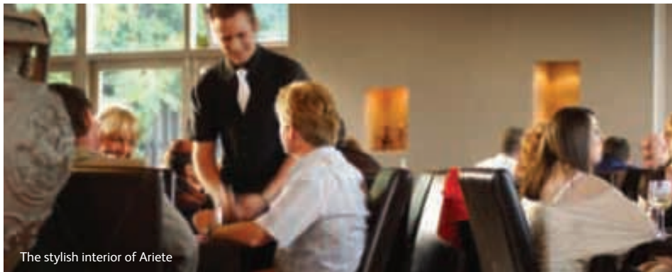
The stylish interior of Ariete