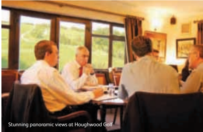
Stunning panoramic views at Houghwood Golf

St.Helens is a serious option for anyone organising conferences, exhibitions or business functions in the Northwest, as well as an accessible and appealing destination for delegates.