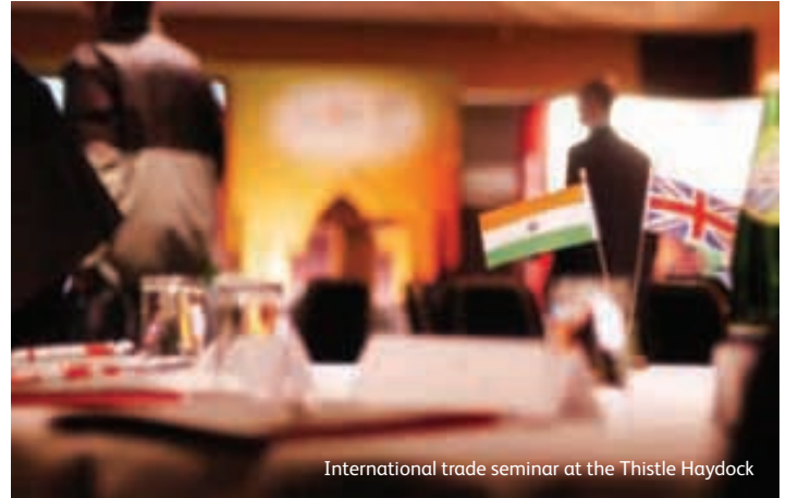
International trade seminar at the Thistle Haydock