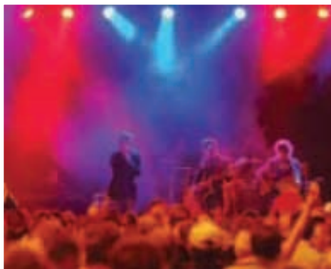
Echo & The Bunnymen