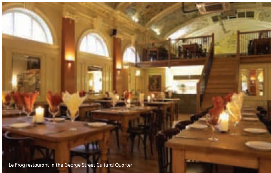
Le Frog restaurant in the George Street Cultural Quarter